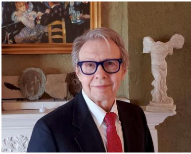
Surrounded by reminders of long healthy life